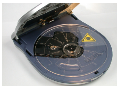
Bio-Disk placed on a player (concept)